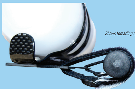
Shows threading of the straps