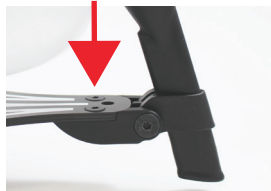
TORPEDO VERSA CARBON MOUNTS: M4 x 10 mm Flat Head Screws