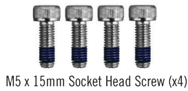
M5 x 15mm Socket Head Screw (x4)